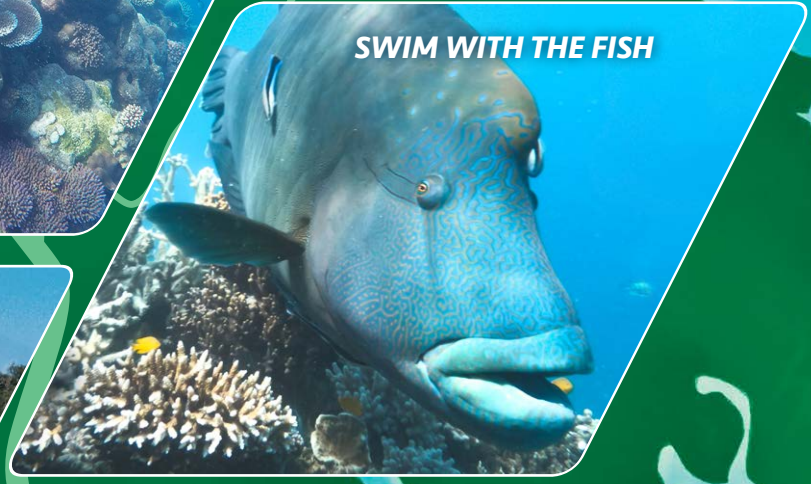
SWIM WITH THE FISH