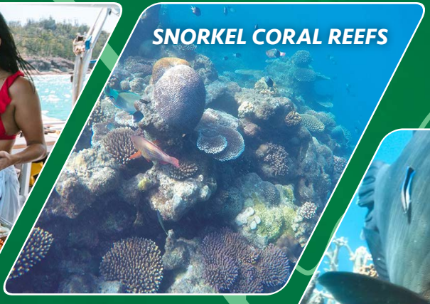
SNORKEL CORAL REEFS