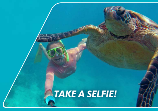
TAKE A SELFIE!