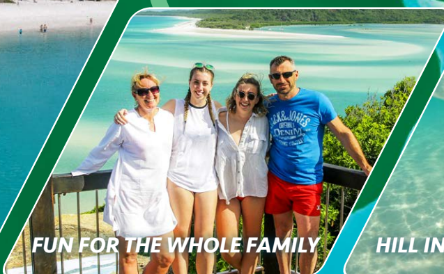
FUN FOR THE WHOLE FAMILY