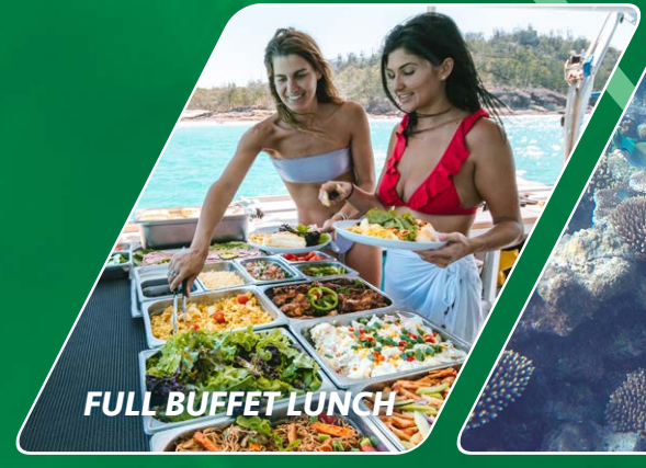
FULL BUFFET LUNCH