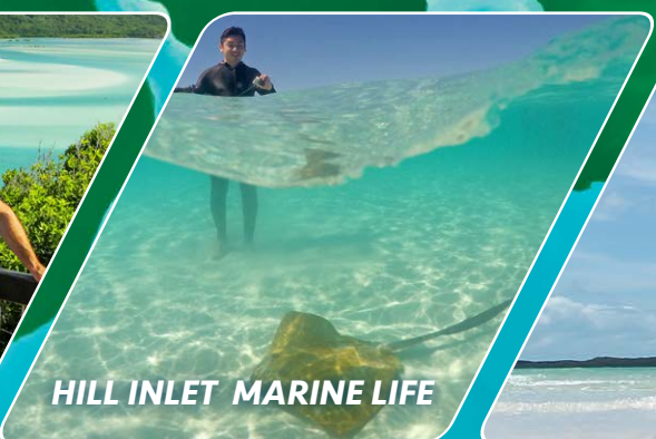
HILL INLET MARINE LIFE