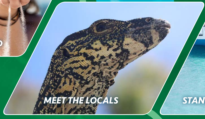
MEET THE LOCALS