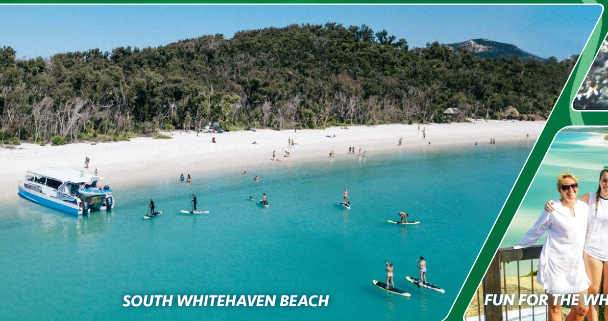
SOUTH WHITEHAVEN BEACH