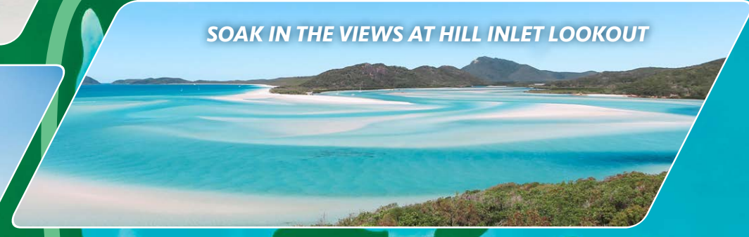
SOAK IN THE VIEWS AT HILL INLET LOOKOUT