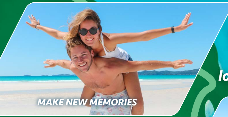
MAKE NEW MEMORIES

Explore both ends of Whitehaven Beach & an awesome snorkelling location on your day tour in paradise!