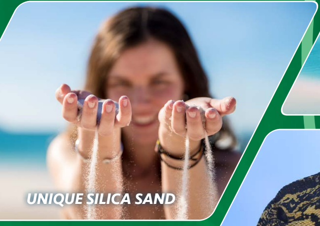
UNIQUE SILICA SAND

Explore both ends of Whitehaven Beach & an awesome snorkelling location on your day tour in paradise!