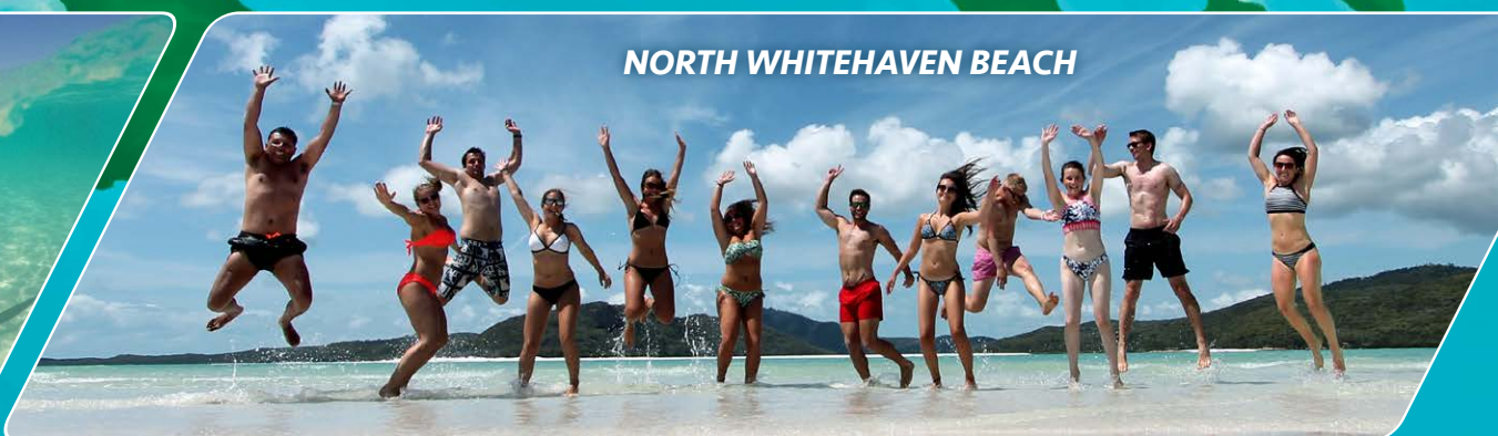
NORTH WHITEHAVEN BEACH