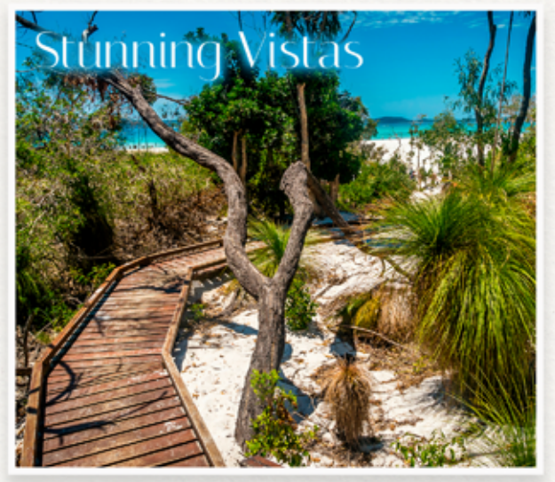
take the road less travelled