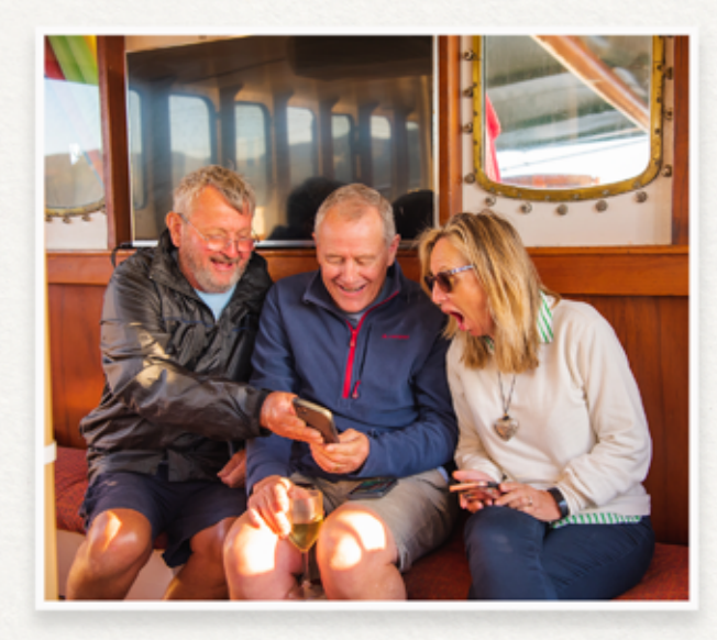
Enjoy those special moments