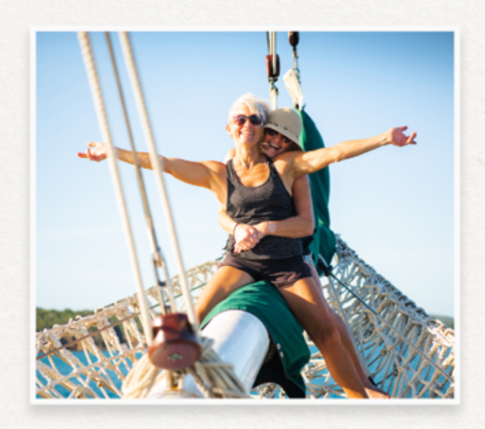
Your adventure starts today

Unwind and explore the Whitsundays at your own pace on our 5-day, 4-night cruise. Soak up the sun on deck, snorkel in crystal-clear waters, or simply relax and enjoy the stunning scenery. With plenty of free time, this cruise is perfect for those seeking a tranquil escape.